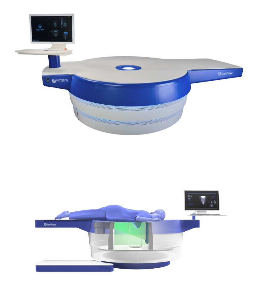
Conceptual image of IzoView Breast CT

IzoView has been initially designed for breast imaging.