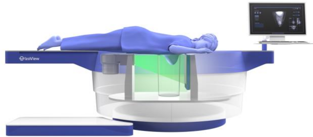
Conceptual image of IzoView Breast CT

IzoView has been initially designed for breast imaging.