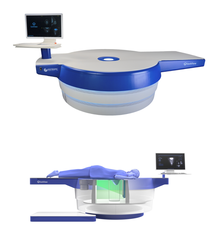
Conceptual image of IzoView Breast CT

IzoView has been initially designed for breast imaging.